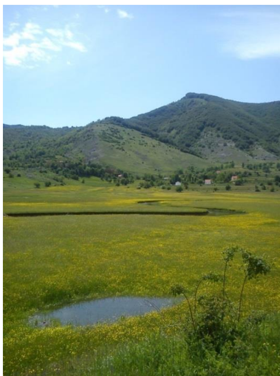
Figure 3. External morphology of fluvial soil at the site Gradina, between Gacko and Nevesinje (Tunguz, 2015)

During the studied area, two profiles of fluvial soil were open, and profile no. 13 represents the fluvial soil of the studied area (Gradina site).