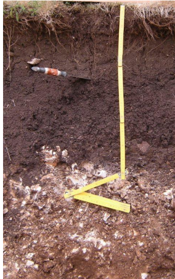
Figure 5. Internal morphology of fluvial soil (Tunguz, 2015)

Order: Hydromorphic soils Class: Layers or undeveloped (A)-G or (A)-C Type: Fluvial or alluvial (fluvisol) Subtype: Carbonate Variety: Medium deep Profile: (A)-I-II-C Forms: loamy