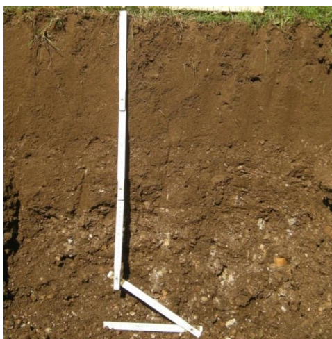
Figure 4. Internal morphology of fluvial soil (Tunguz, 2015)

Order: Hydromorphic soils Class: Layers or undeveloped (A)-G or (A)-C Type: Fluvial or alluvial (fluvisol) Subtype: Carbonate Variety: Medium deep Profile: Amo-I-II-C Form: Loam - Pell- PeGIII