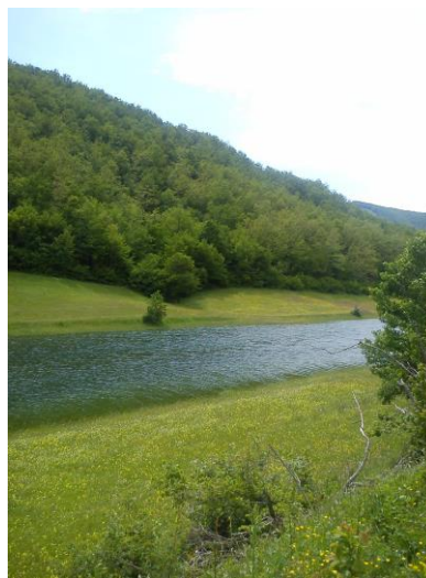
Figure 2. External morphology of fluvial soil near Nevesinje in spring (Tunguz, 2018)

The Climate of the wider area of Gacko is the continental mountains climate, which means long and cold winters (from the second half of November to the first half of April with temperature occasionally reaching -30^{\circ}\text{C} ) and very short summers (June to August) with temperature sometimes reaching above 30^{\circ}\text{C} . The biggest studied area is covered by grazing grasslands and some natural grass fields (Tunguz, 2015).