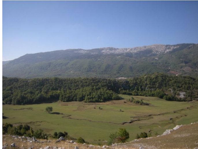
Figure 1. External morphology of fluvial soil at Gacko in autumn (Tunguz, 2018)

characteristics. From quarter sediments and alluvium sediments are present as well as lake sediments. In RS there are three different climate zones, without strongly marked borders such as the abstemious area of North Bosnia and Posavina, central mountain area of central Bosnia and maritime influence area of Hercegovina. Average rainfall is quite significant, around 1250mm but very disadvantaged area as per rainfall and weather conditions. Rainfall is very limited in areas with the best quality soils (Semberija, Posavina, around 700/750mm) while the highest level of rainfall is in karst areas of Dinaridi (over 1500mm). Limited rainfall is recorded during the most needed periods for water, especially present in maritime influence areas where rainfall levels are highest during the winter period (Integrated Water Management Strategy of the Republic of Srpska, 2015).